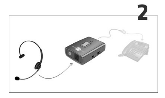
Insert the headset cord (that was in the telephone before) in the front of the Busylight box.