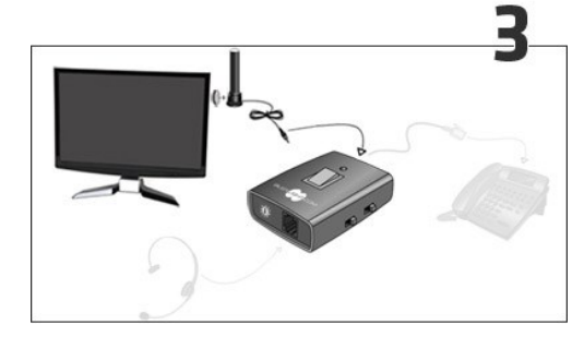
Insert the cord for the Busylight lamp into the Busylight box and mount the lamp on your screen (or another visible place) with the round tape. Avoid placing the lamp in direct sunlight.