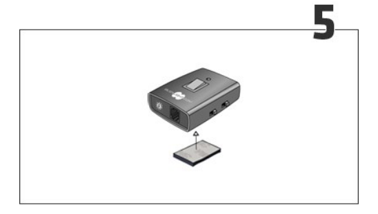
Fix the Busylight box to the table using the rectangular tape.