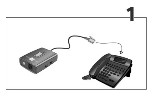
Take the headset cord out of the telephone and insert the pre-installed cord from the Busylight box into the telephone instead.