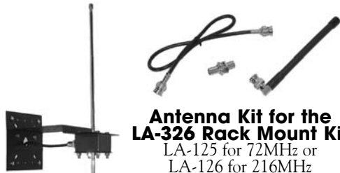
Antenna Kit for the LA-326 Rack Mount Kit LA-125 for 72MHz or LA-126 for 216MHz