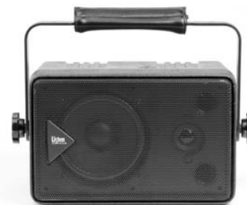
LA-316 Expansion Speaker 10 watt, 2 channel speaker