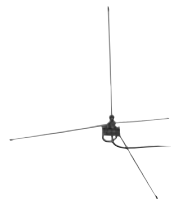
216 MHz Ground Plane (Remote Mount) LA-107 for 216 MHz Designed for outdoor installation

The single solution for all of your indoor remote antenna needs. Includes: 72 and 216 MHz components; flexible and rigid dipoles and monopole radials; hardware for multiple mounting configurations.