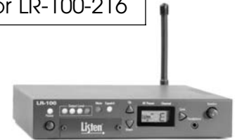
LR-100 shown with security cover and antenna in place

Listen's LR-100 Stationary Receiver / Power Amplifier is a stationary auditory assistance receiver with a built-in power amplifier. When used with a Listen transmitter, the LR-100 can deliver high quality audio for use in a variety of locations. The built-in 15 watt power amplifier (15 peak, 10 RMS) can be used to either amplify the receiver audio, or it can be used independently.